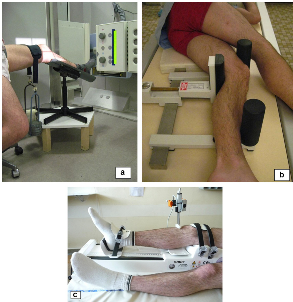
Figure 1 a: passive stress radiograph according to Lerat, with a 9-kg load; b: Telos® device; c: GNRB®, computerised laxity assessment system that measures sagittal translation of the tibia at 20° of knee flexion.

(e.g., procedure on the meniscus or on the ligament or synovial membrane biopsy), the ACL was inspected and palpated using a hook. Based on the results, the ACL was classified according to the five stages described by Panisset et al. [11]: “normal ACL”, “healed to the roof of the notch” (anteromedial bundle preserved), “posterolateral bundle preserved”, “healed to the posterior cruciate ligament” (PCL), and complete tear “empty notch”. The arthroscopic appearance of the ACL was the reference standard for the evaluation of diagnostic performance of laxity measurements using stress radiographs and the GNRB®.