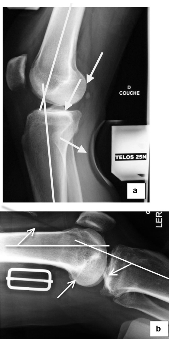
Figure 3 Quality score for the Telos® and Lerat radiographs.